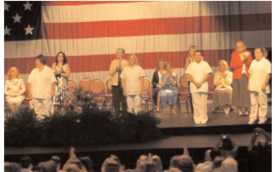
Presentation of nurses to the audience after their pinning

For more information about nursing, view the Occupational Outlook Handbook at www.bls.gov . Contact the Wallace State Nursing Department at www.wallacestate.edu or 256/352-8199.