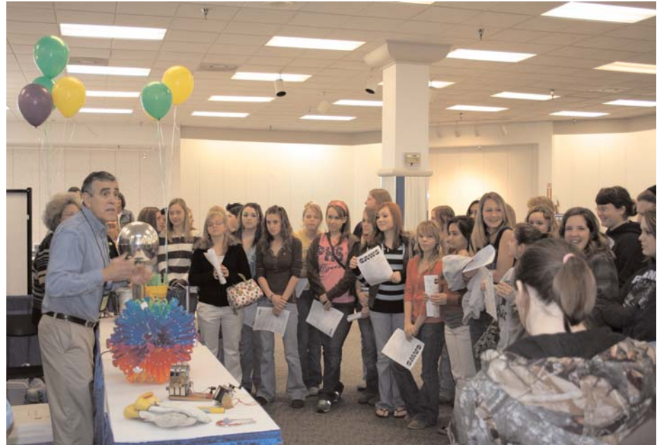
Cullman and Blount County Students attend CAWS Career Expo

Distribution Center, McGriff Industries, First South Farm Credit, Drinkard Development, Wallace State – Hanceville, REHAU, NAFCO, the City of Cullman Industrial Development Board and the Cullman County Industrial Development Board.